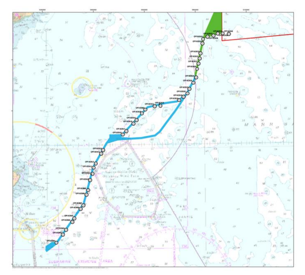
Fig 1 – Export cable corridor survey locations.