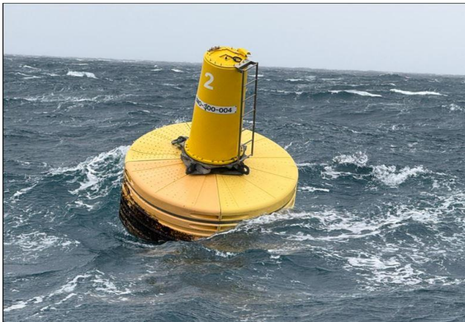
Fig 2 – Special Mark (No2) off location