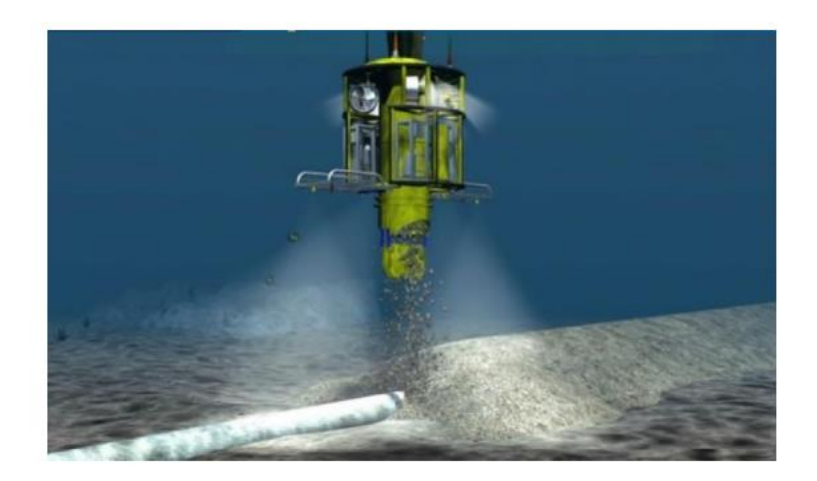
Fig 2 – Subsea rock installation on inter-array cables.

The installation Vessel FFPV Nordnes will utilise its flexible fall-pipe system and ROV to install the rock on the inter-array cables as shown below in fig 2. Vessel details are shown in below in section 3. Nordnes is expected to arrive at the Seagreen site on or around the 10<sup>th</sup> of August.