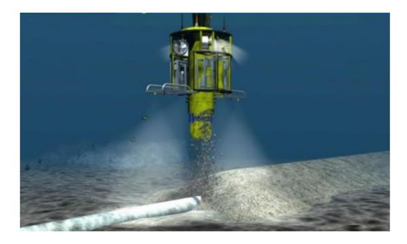
Fig 2 – Subsea rock installation on inter-array cables.

The installation Vessel FFPV Nordnes will utilise its flexible fall-pipe system and ROV to install the rock on the inter-array cables as shown below in fig 2. Vessel details are shown in below in section 3.